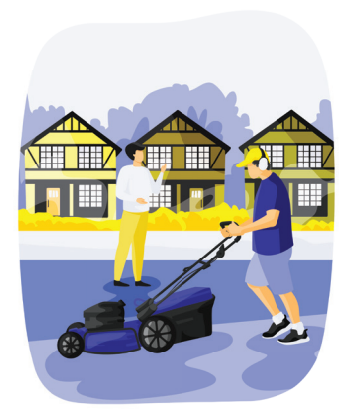
HELP YOUR NEIGHBOR WITH THEIR CHORES